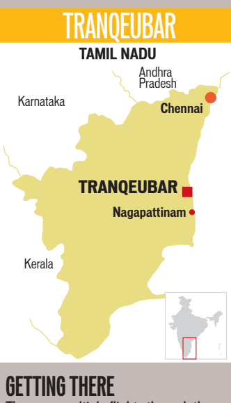
DELITING THERE There are multiple flights through the day from Mumbai to Chennai. From Chennai, the journey to Tranquebar takes five hours by road.

hat's in a name? Not everything. But a coastal town in the Nagapattinam district of Tamil Nadu with a name like 'Tranquebar' certainly had a magical ring to it and enough allure for us to plan a visit.