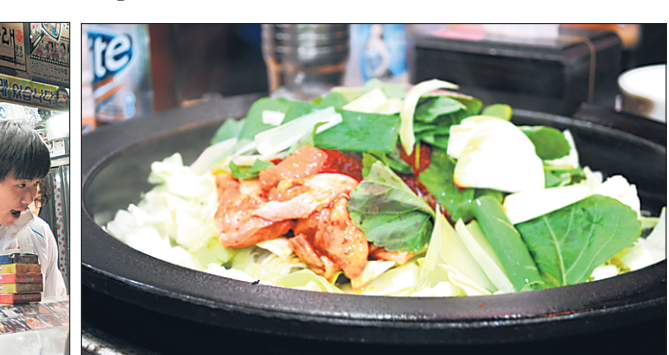
Buyers look forward to some kkultarae at the candy shop The famous Korean barbecue is cooked at the table in front of you

Insadong is also well known for its numerous modern and traditional tea houses that line the main street,